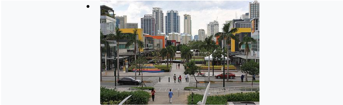
The Bonifacio High Street with the Bonifacio Global City at the Background (2015).