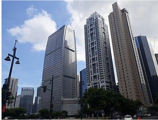
The Finance Centre, The Infinity and The South of Market.