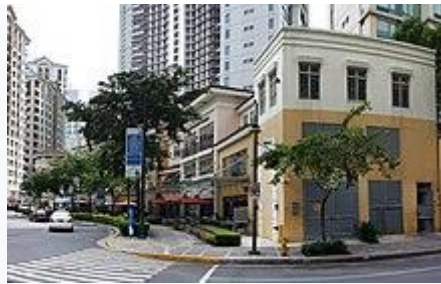
Burgos Circle at Forbes Town Center

The Forbes Town Center is Megaworld's 5-hectare township community, where 8 Forbestown Road, Forbeswood Heights, Forbeswood Parklane, and Bellagio condominiums are located. It has a combination of low-density residential development, shopping strip, dining outlets, and other service facilities.