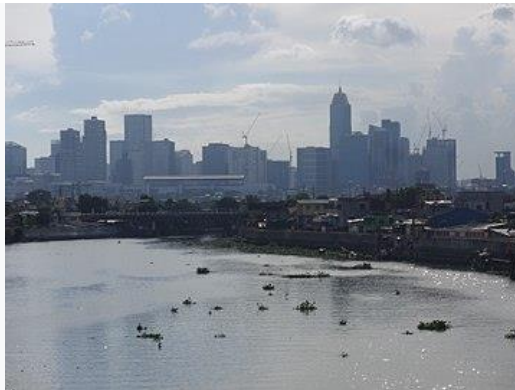
The BGC Skyline from the Pasig River.