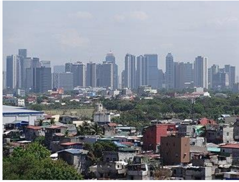
Bonifacio Global City from the Arca South.