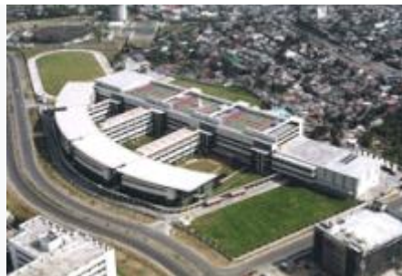
International School Manila

St. Luke's Medical Center, Inc. operates a hospital at the Bonifacio Global City.