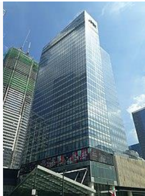
The Philippine Stock Exchange Tower, also known as the One Bonifacio High Street Tower, is the New Headquarters of The Philippine Stock Exchange.