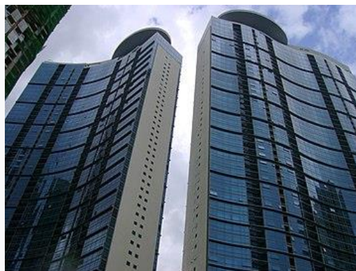
The Pacific Plaza Towers.