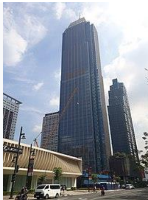
The Grand Hyatt Manila.