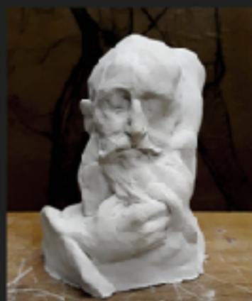
El sueño de Alonso Quijano

RESIN AND FIBERGLASS AND BRONZE | 31 X 19 X 17 CM | ORIGINAL WORK 1/7