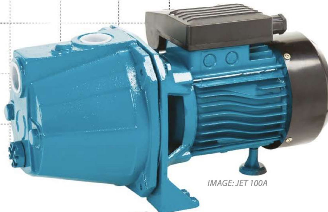
IMAGE: JET 100A