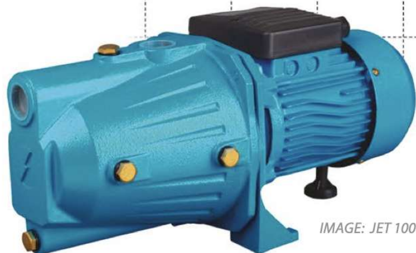
IMAGE: JET 100LONG