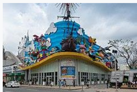
The outer facade of the entrance building, pictured in 2017