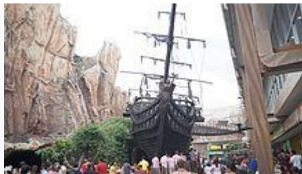
An attraction in Star City, prior to the 2019 fire.