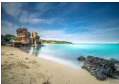
Voulisma Beach Lasithi