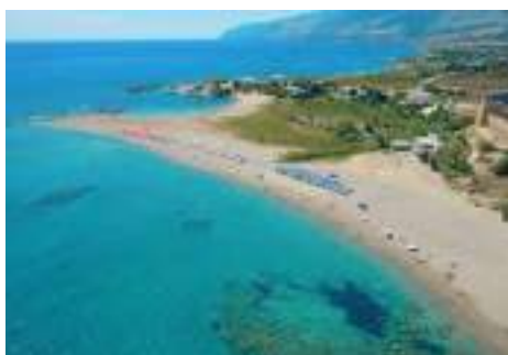
Fragkokastelo Beach Chania