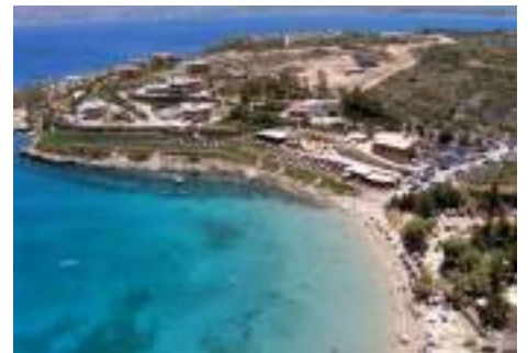
Loutraki Beach Chania