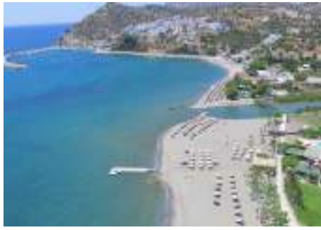
Agia Galini Beach Rethymno