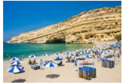
Matala Beach Heraklion