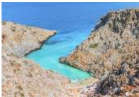
Seitan Limania Beach Chania