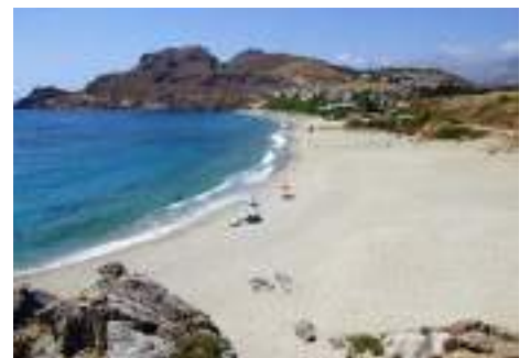
Koufonissi Island Lasithi