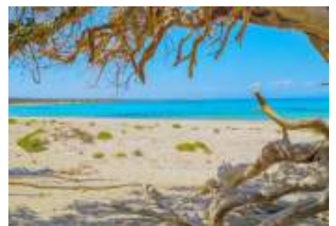
Chrissi Island Lasithi