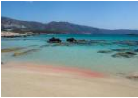
Gouves Beach Heraklion