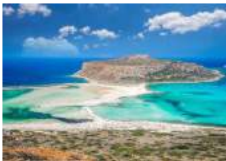
Balos Beach, Gramvousa Chania