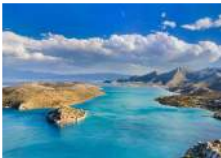
Elounda Beach Lasithi