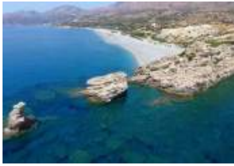
Triopetra Beach Rethymno