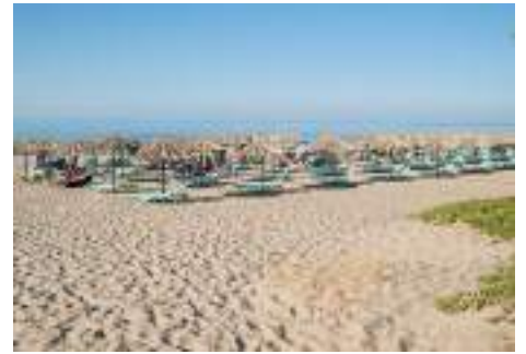
Episkopi Beach Rethymno