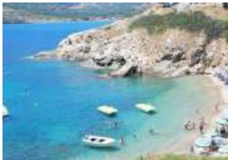
Bali Beach Rethymno