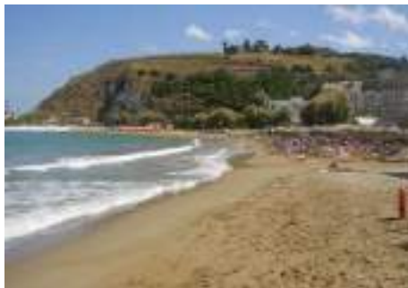
Kalyves Beach Chania