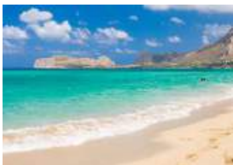
Falassarna Beach Chania