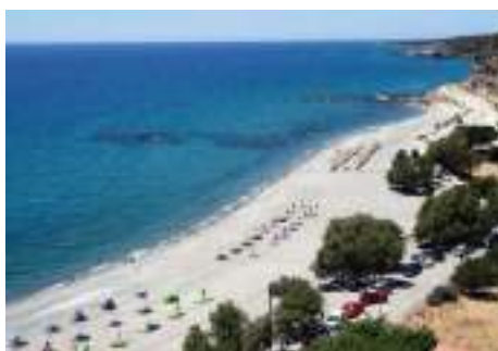
Rodakino Beach Rethymno