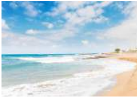
Malia Beach Heraklion