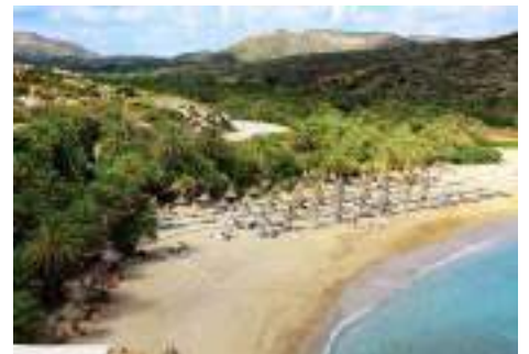
Vai Beach Lasithi