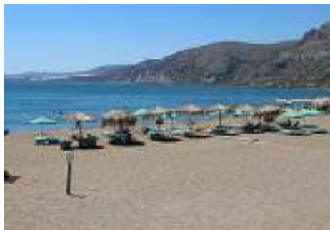
Pachia Ammos Beach Chania