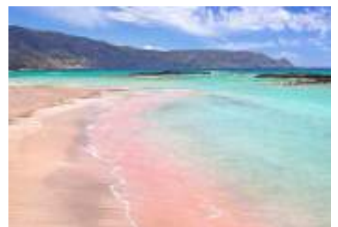
Elafonisi Beach Chania