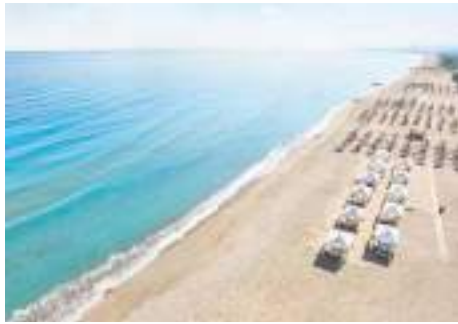
Rethymno Beach Rethymno