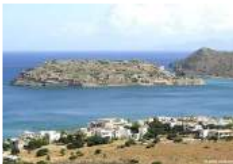
Plaka Beach Lasithi