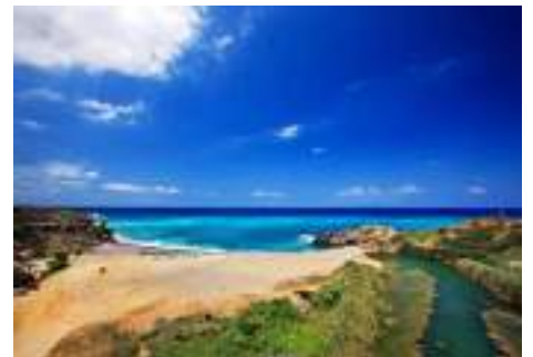
Geropotamos Beach Rethymno