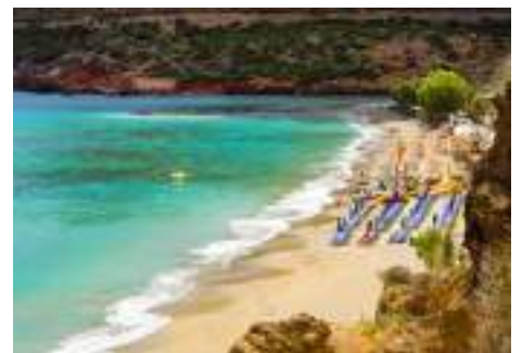
Livadi Beach Chania