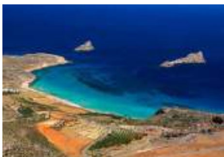
Xerokambos Beach Lasithi