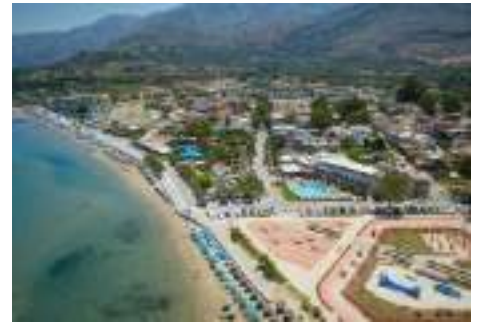
Georgioupoli Beach Chania