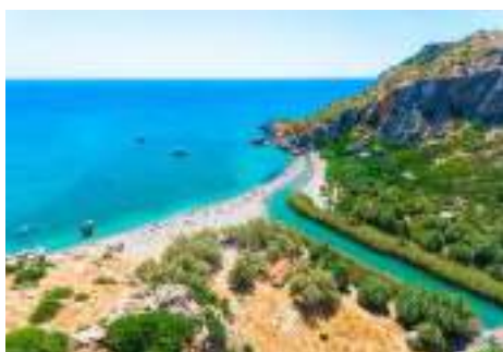
Preveli Beach Rethymno