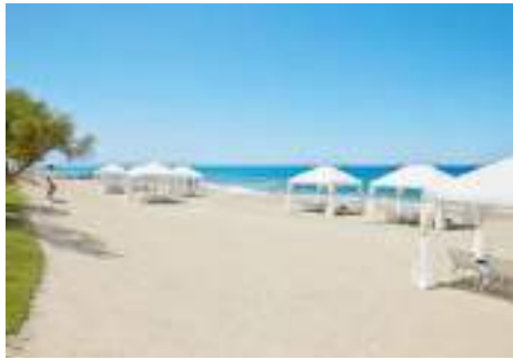
Adelianos Kampos Beach Rethymno