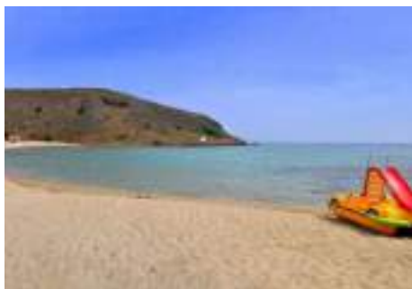
Kalivaki Beach Rethymno