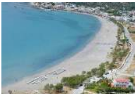
Plakias Beach Rethymno