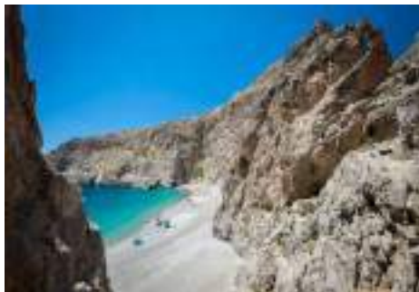
Agiofarago Beach Heraklion