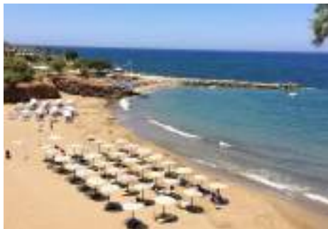
Panormo Beach Rethymno