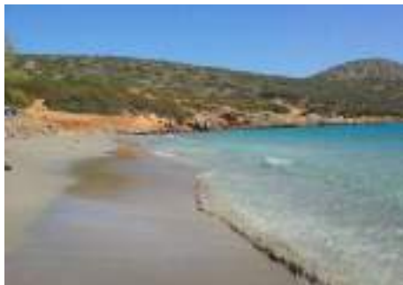
Kolokitha Beach Lasithi