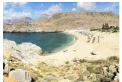
Sxinaria Beach Rethymno